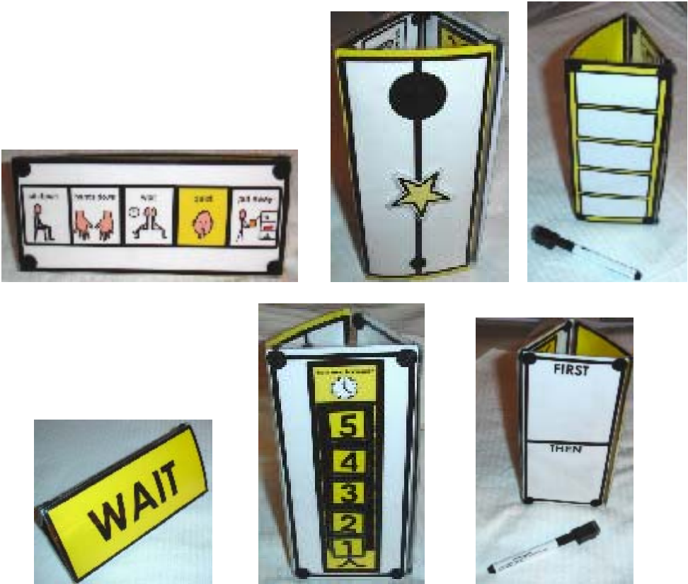
Barbara C. Bloomfield 2005

triangular shape and stand it on its side or on end. For storage, e.g. you may want to fold it all the way down so that it resembles a wallet. Experiment with the Fold Up and use it in the way that best suits the needs of both you and your student.